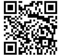
The New Forest Beach Hut Owner's Association - NFBHOA

New Forest Beach Hut Owners Association (NFBHOA) was formed in 1995 to represent to NFDC the views of Members at Calshot, Barton-On-Sea, Hordle Cliff and Milford-On-Sea. This notice board has been provided by New Forest District Council (NFDC) to enable better communication with our Members, other beach hut owners and beach users in general. The beach huts are privately owned and except for those on Cadland Beach, an annual Site Rental is paid to NFDC who own the land. More information can be found on our web site: www.newforestbeachhuts.com also accessible by scanning this QR code.