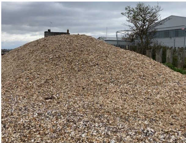
Figure 3 – Shingle Stockpile (HCC Land)