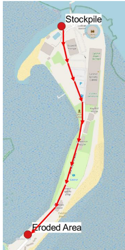
Figure 2 – Transfer route