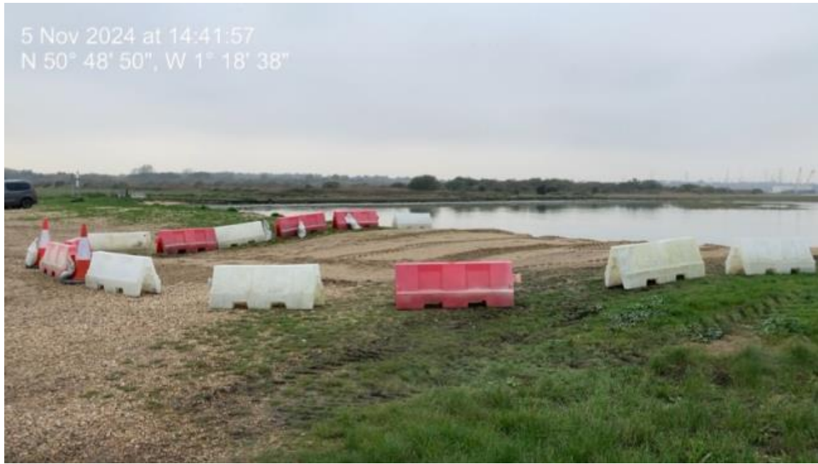
Figure 4 – Completed works: barriers remained in place to allow settlement