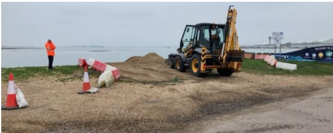
Figure 4 HCC & NFDC operatives working to infill eroded areas