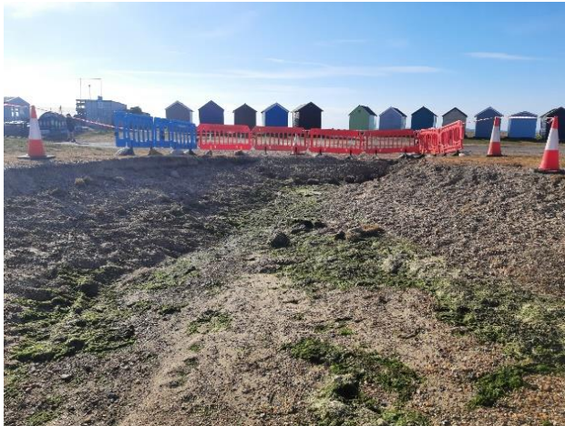
Figure 1 – Eroded Area (NFDC Land)